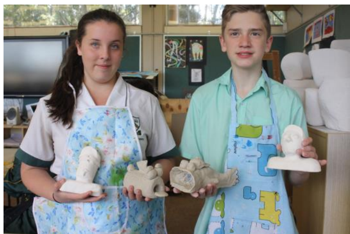
The Year 7 CAPA class have been busy in their Visual Arts class making clay busts.