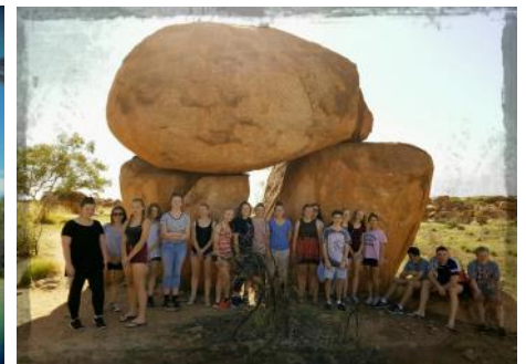
Breakfast at Devil's Marbles