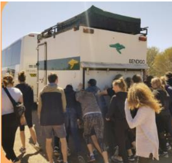
Pushing the bus over the border