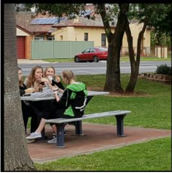
Lunch at Nerrandera