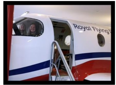
Royal Flying Doctor Service