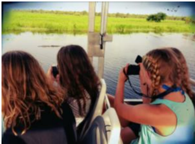
Sunset Cruise Kakadu wetlands