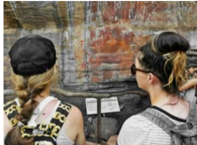
Indigenous Art Kakadu National Park