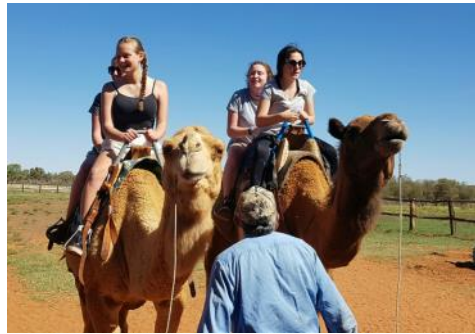
Camel rides were popular