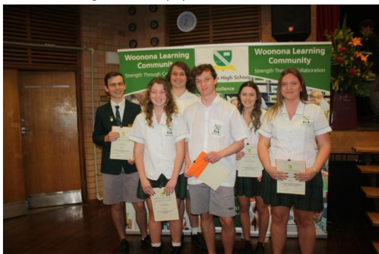
Outstanding Academic Achievement