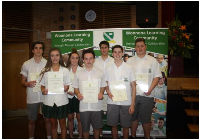
Academic Excellence in a Subject