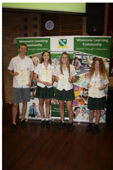
High Academic Achievement