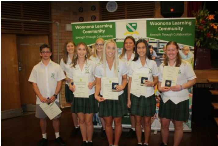
Principal's Award Recipients