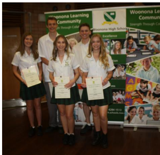
Commendable Academic Achievement