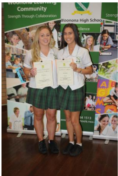
Excellent Academic Achievement